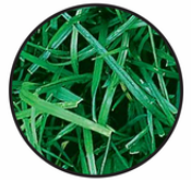
WATCH IT GROW