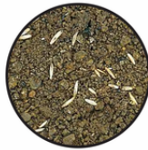
SPREAD THE SEED