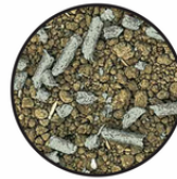
APPLY THE PENNMULCH